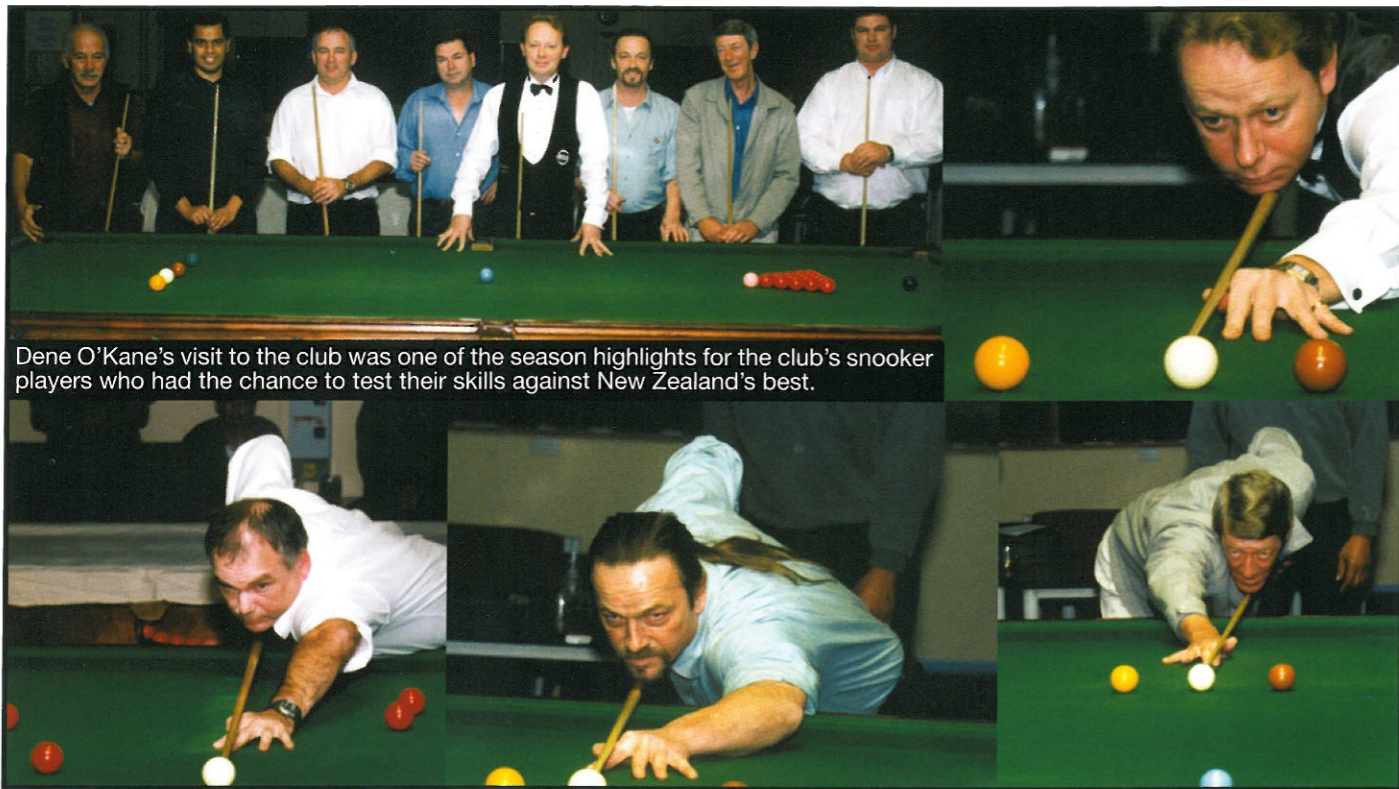
Dene O'Kane's visit to the club was one of the season highlights for the club's snooker players who had the chance to test their skills against New Zealand's best.